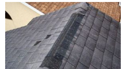
Hip and ridge cap lifting