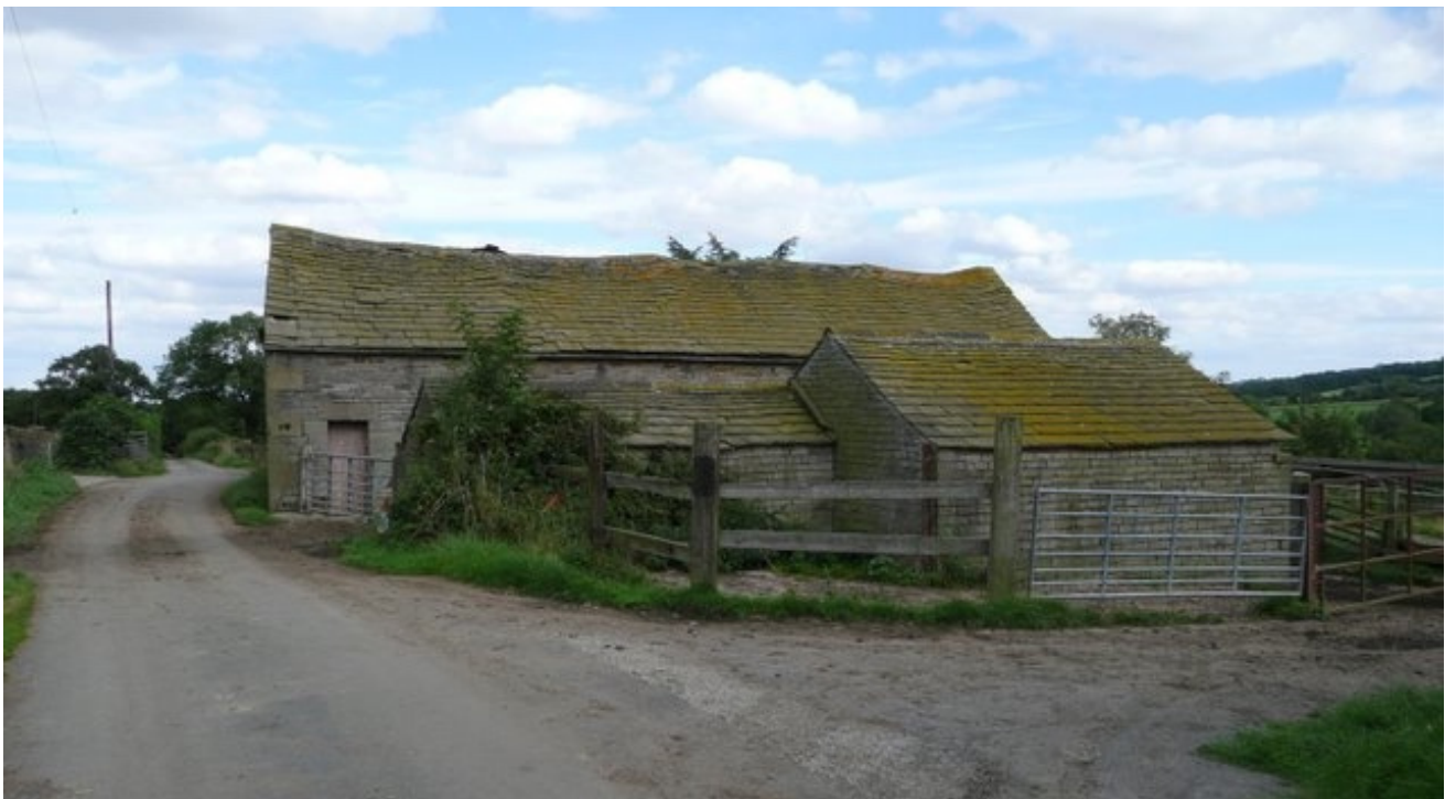
Sagging roof - the top of the roof is not a straight line, the middle dips down which indicates roof damage.

Roof sagging can be caused by rotten decking or broken rafters. In both cases, a roofing contractor will need to tear off the roofing materials to repair the broken and rotten boards underneath.