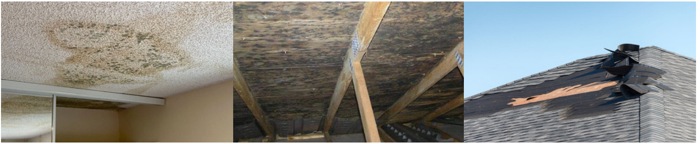
Water stains, black marks, and missing shingles are all indicators of roof leaks.

We mentioned earlier that roof leaking didn't necessarily mean that your roof needs replacement - and that's true.