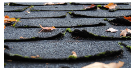
Shingles curling at the edges